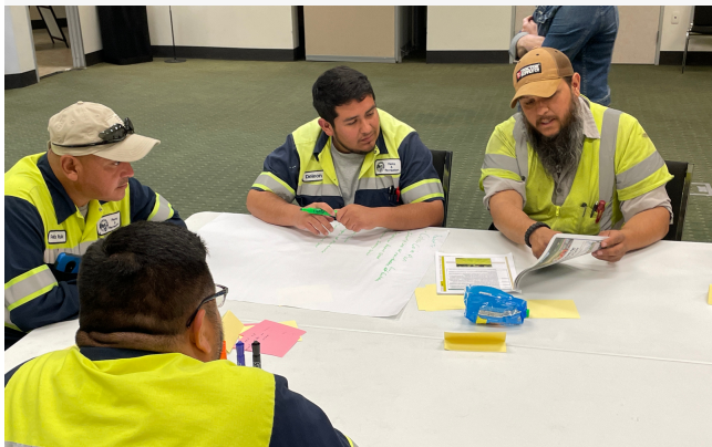
Parks Dept. staff look at their park existing conditions and identify future priorities