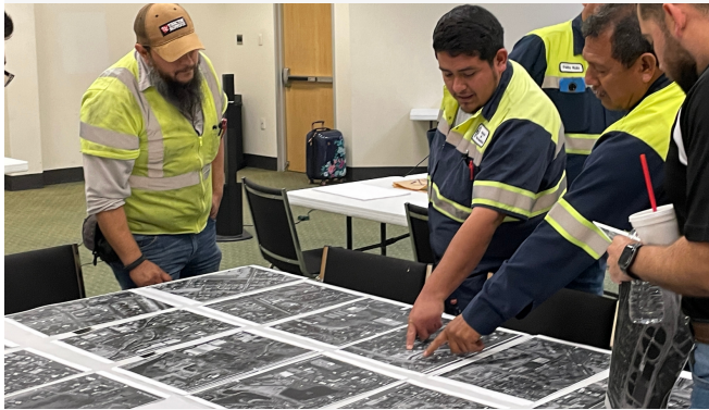
Parks Dept. staff use maps to look at their community parks system together.